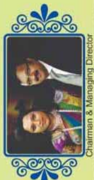
Chairman &amp; Managing Director